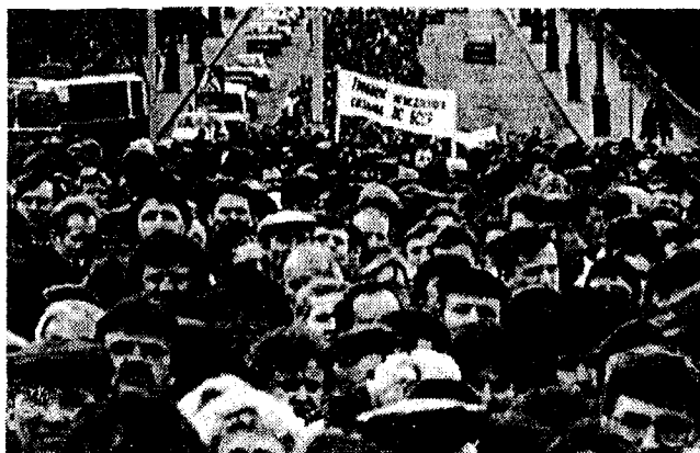
A strike in Byelorussia resumed at factories in Minsk, where workers staged a march for higher wages.

No major industrial power has experienced the kind of drastic decline in economic output faced by Russia today -- outside of defeat in a war -- since the Great Depression of the 1930's. In addition to a projected decline in output of 5% this year, Russia will see unemployment jump from 1.5% to 4% (around six million workers) in 1991. Moreover, these figures, arrived at by Western economic experts, underestimate the real level of unemployment in Russia by many millions. The response of the ruling class to such an impending and unprecedented collapse was the removal of Ryzhkov as prime minister and his replacement by Valentin Pavlov. The Pavlovian response to economic catastrophe was to put