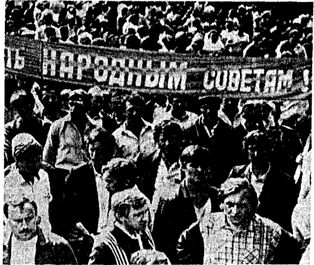
Striking miners rallying under a banner that read "Power to the People's Soviets."

It is the task of Yeltsin, the "democrats" and the left to assure that the politicization of this struggle not occur on the class terrain of the proletariat, that it be diverted into the deadend of a struggle to "democratize" the state apparatus of Russian capital. However, if capital were to be successful in diverting the worker's struggle from their own class terrain, if the elan of the proletariat were to be broken by the left, capital would have a second option in dealing with the "social question": to promise security, an end to chaos through a return to law and order, under the wing of a strong state, etc. -- in other words, the program of the right, of Soyuz and Pamyat, of a man on a white horse like Boris Gromov, the "hero" of the Afghan war. The conditions for a "Chilean" solution to the crisis of Russian capital does not now exist, because of the mounting tide of class struggle; nonetheless, important factions of the ruling class are even now preparing themselves for the moment when the left will have completed its work, and their time will have arrived.